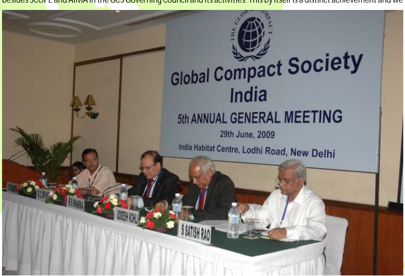
5<sup>th</sup> AGM of Global Compact Society

We were also able to enlist the support and association of three largest Industry Chambers FICCI, CII and ASSOCHAM, besides SCOPE and AIMA in the GCS Governing Council and its activities. This by itself is a distinct achievement and we