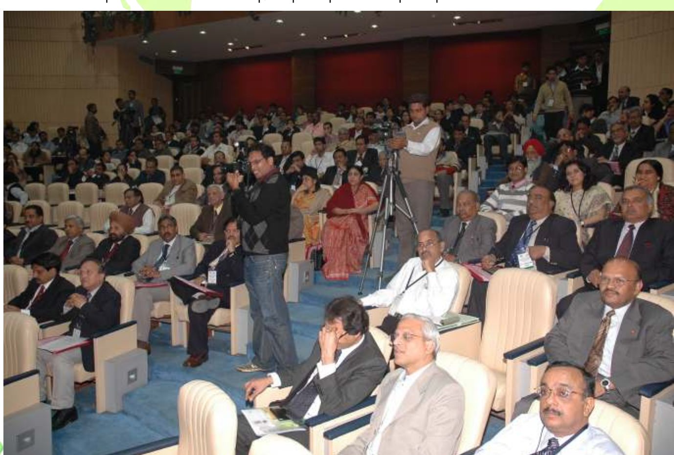
4<sup>th</sup> GCS National Convention in progress