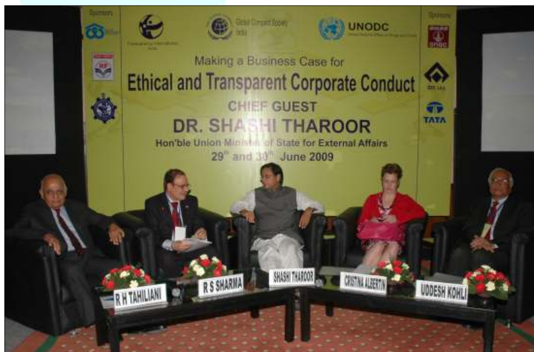
Workshop on Making a Business case for Ethical and Transparent Corporate Conduct