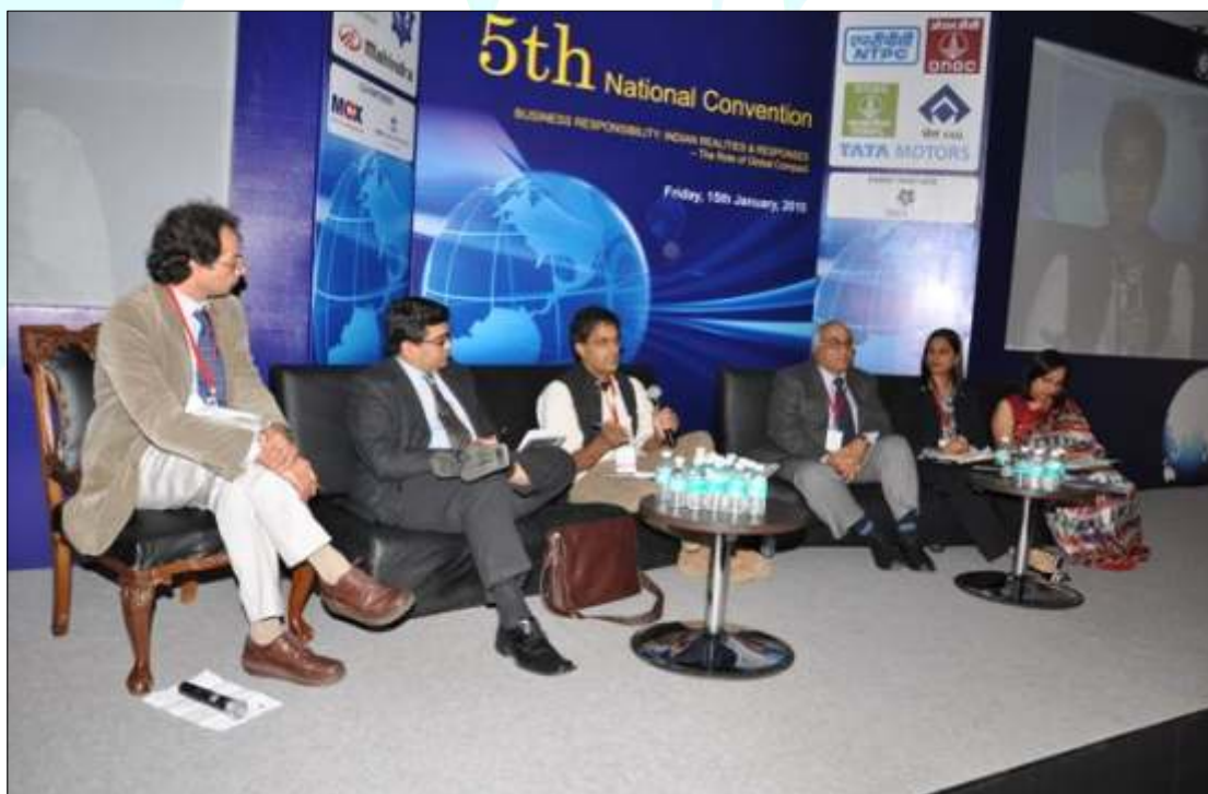
Fifth National Convention of GCN in Mumbai