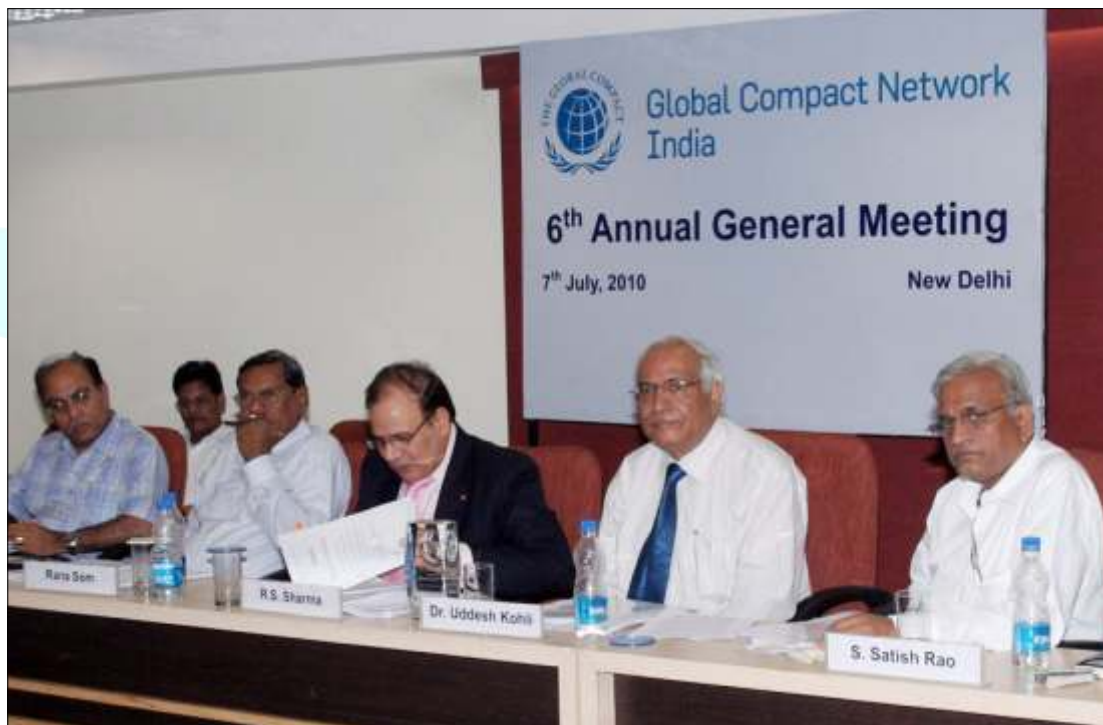
6 th AGM of Global Compact Network