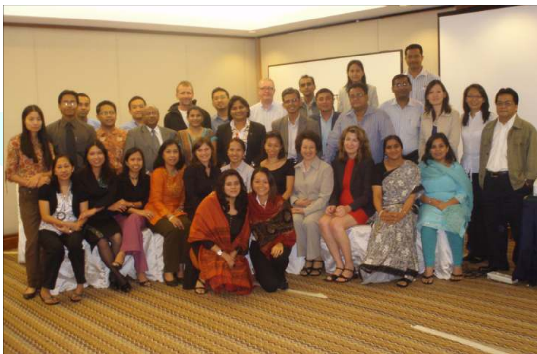
Training of Trainers on UN Global Compact at Kuala Lumpur