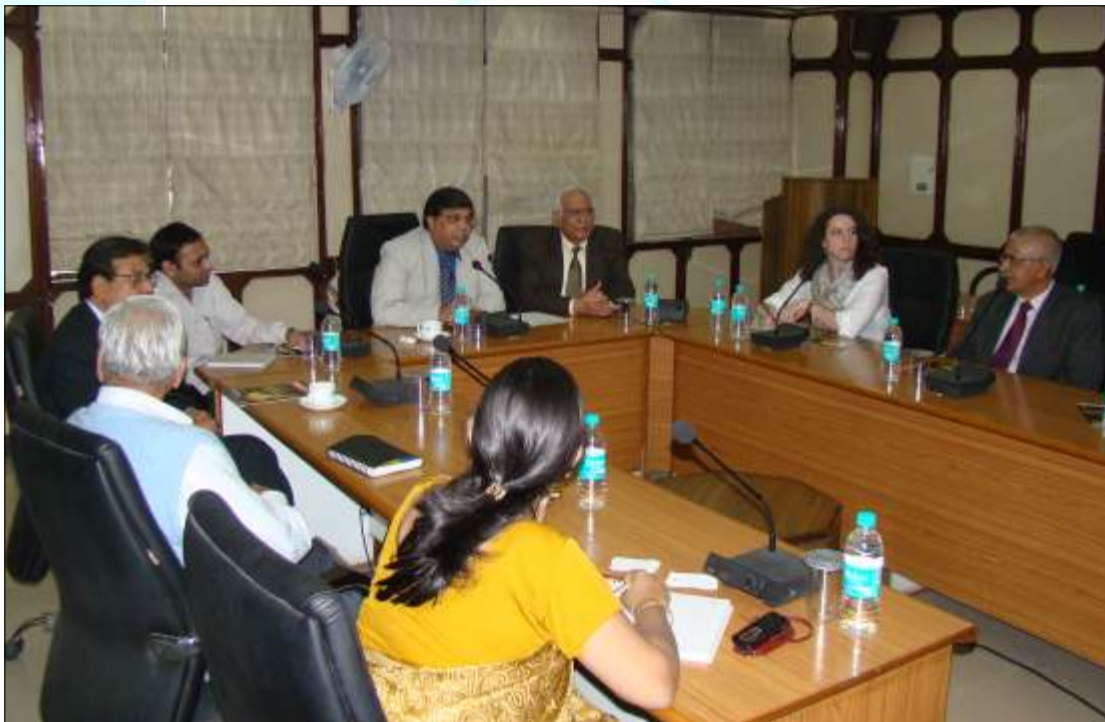
GCN Monthly meeting in progress