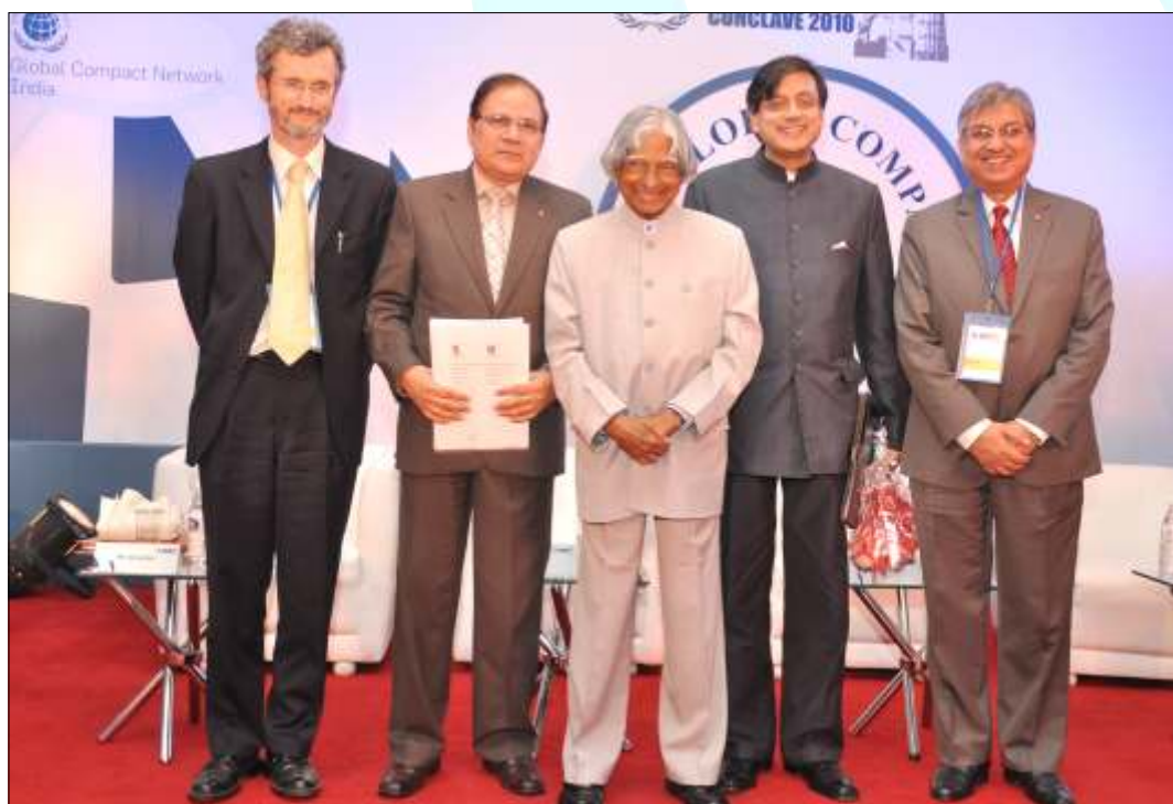
Global Compact Asia Pacific Regional Conclave 2010