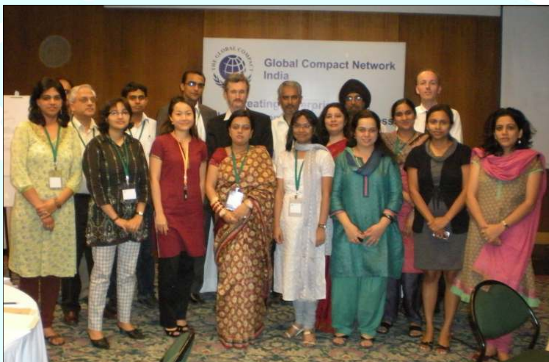
Training of Trainer Workshop on Communication on Progress