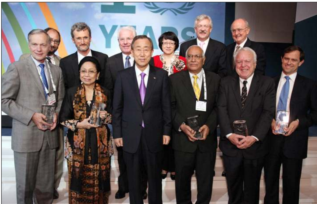
Ten Awardees with UN Secretary General Ban Ki Moon