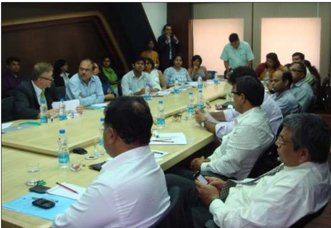
Knowledge sharing and networking meeting in progress

Knowledge sharing and networking meetings provide a platform to the UNGC signatories from India to come together to highlight their individual best practices in responsible business practices and sustainable initiatives.