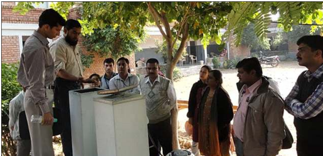
Field visit of the trainees to a model village developed by IRRAD

A three day training programme was organized by GCN India, jointly with Institute for Rural Research and Development (IRRAD) in Gurgaon from 24th-26th November 2010. The training was attended by 17 middle and senior level representatives from corporate sector. The training highlighted the importance of engagement with the communities and challenges faced by the