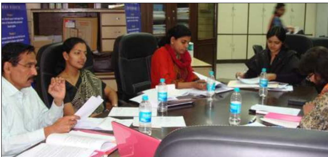
COP training in progress at GCN Secretariat

A one and a half day orientation workshop cum training was organized by GCN secretariat on 7-8th March 2011. The aim of the workshop was to facilitate preparation and uploading of COP report by Global Compact corporate signatories. The GCN secretariat staff updated the trainees on the new features of the advanced COP report. COP differentiation model was explained to them during the training. Participants included officials from Shipping Corporation of India, Tata Chemicals and JSL Stainless Limited.