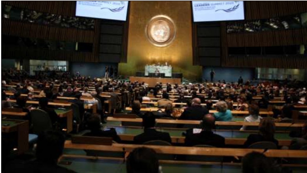
Leaders Summit, New York