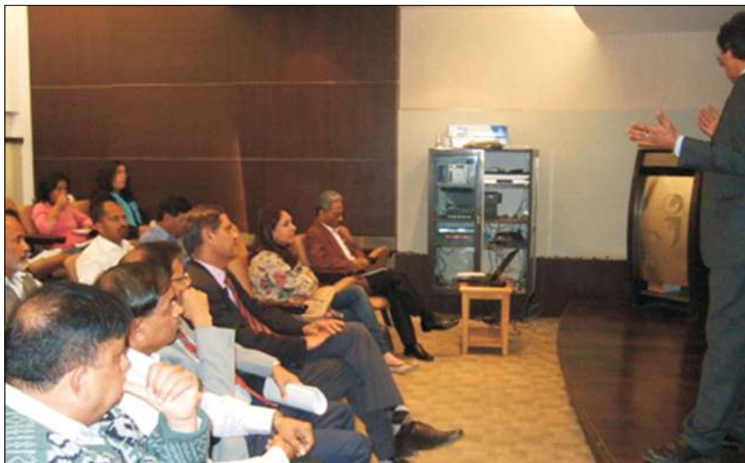
Special briefing on human rights for GCN members at JSL Stainless limited.

A special briefing on human rights was organized by GCN India and was hosted by JSL Stainless Limited on March 11th, 2011. The purpose of the briefing was to apprise the GCN members with the latest and most significant national and international developments in human rights and business.