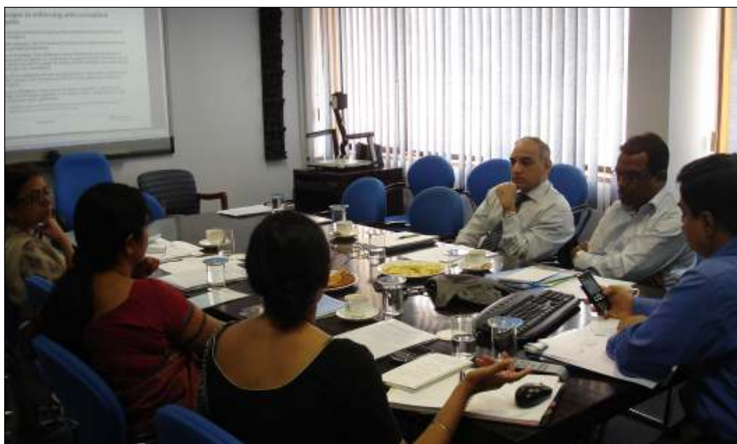
Subcommittee meeting in progress

GCN subcommittees form an integral part of GCN strategic plan 2015. 4 subcommittees were operationalised during the year. Their main activities are as follows: