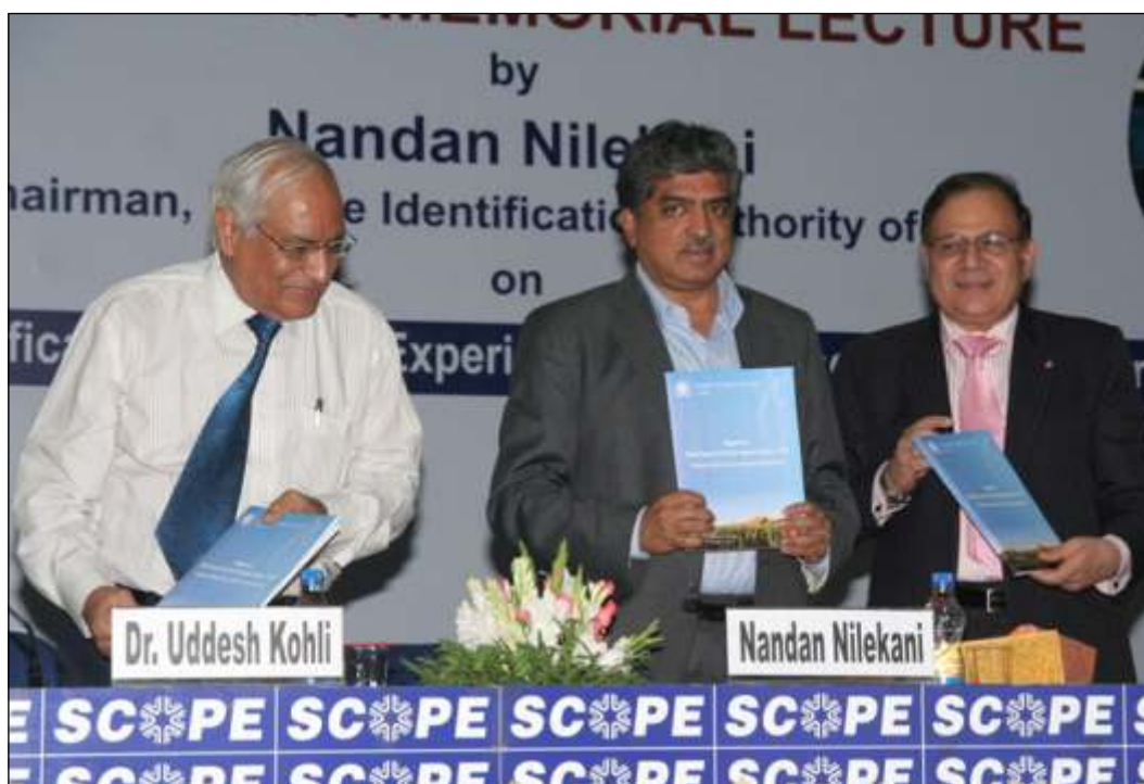
Report release by Mr. Nandan Nilekani on the occasion of 1st Subir Raha Memorial Lecture