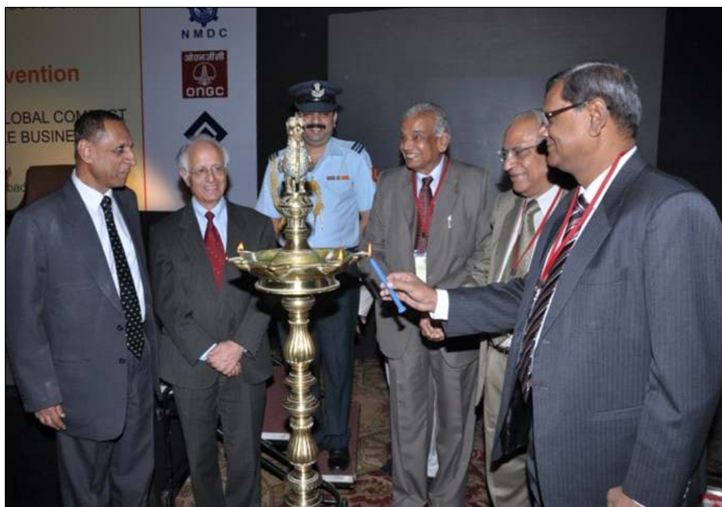
6th National Convention of GCN in Hyderabad

The Sixth National Convention of Global Compact Network, India bearing the theme 'Globalisation through Global Compact: Towards a Sustainable Business' was held at Taj Krishna, Hyderabad on 4th February 2011. The Convention was well attended by over 200 delegates from the corporate, civil society organisations and academic institutions.