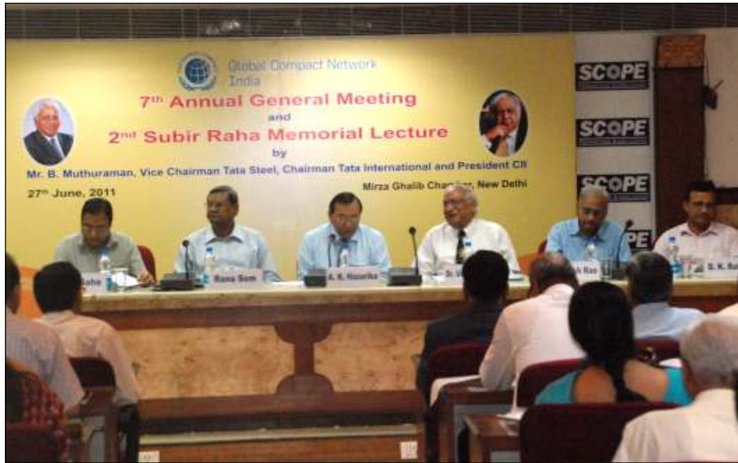
7th AGM of Global Compact Network

business practices. Immediately after this AGM, we will hear him on his vision surrounding the ethical business practices and transparency in the business.