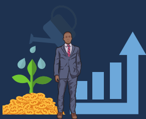
FINANCE AND INVESTMENT

International and domestic consortiums are scaling efforts for sustainability. However, certain roadblocks, the lack of relevant skills in the workforce, access to new technology and paucity of funding are limiting their progress towards realizing their sustainability ambitions. There are five key areas which Indian businesses can focus on to accelerate action and progress towards Agenda 2030. UNGC's new initiative "Forward Faster 2030" revolves around those most crucial thematic areas which are seen to have a long lasting impact on the fulfillment of the Sustainable Development Goals.