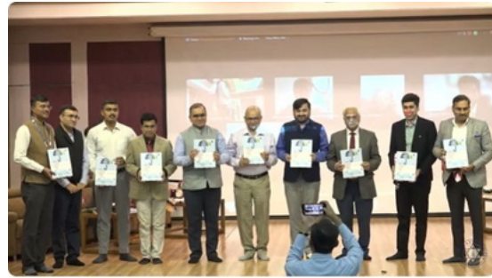
International Anti Corruption Day | 9th December 2023 | Atmiya University