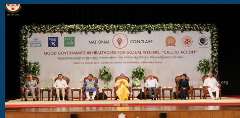
National Conclave on "Good Governance in Healthcare for Global Welfare"