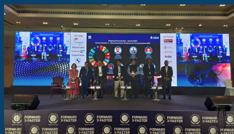
Regional Convention – South 2023