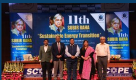
11th Subir Raha Memorial Lecture 2023