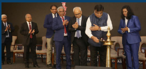
UN GCNI Kerala Regional Conference 2023