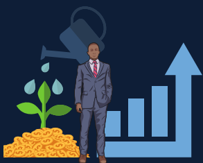
FINANCE AND INVESTMENT

International and domestic consortiums are scaling efforts for sustainability. However, certain roadblocks, the lack of relevant skills in the workforce, access to new technology and paucity of funding are limiting their progress towards realizing their sustainability ambitions. There are five key areas which Indian businesses can focus on to accelerate action and progress towards Agenda 2030. UNGC's new initiative "Forward Faster 2030" revolves around those most crucial thematic areas which are seen to have a long lasting impact on the fulfillment of the Sustainable Development Goals.