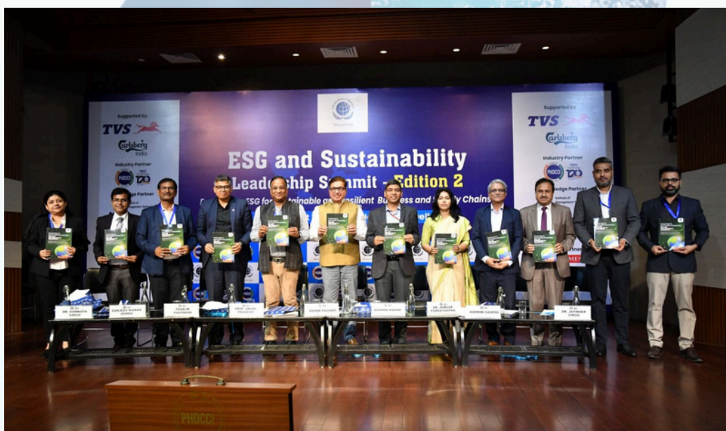
Launch of the ESG Best Practices Compendium: From Commitments to Measurable Impact

By embedding ethical principles within technology, governance, and business strategy, India is well positioned to lead a new development narrative—one anchored in transparency, inclusivity, and long-term resilience, and aligned with global sustainability imperatives.